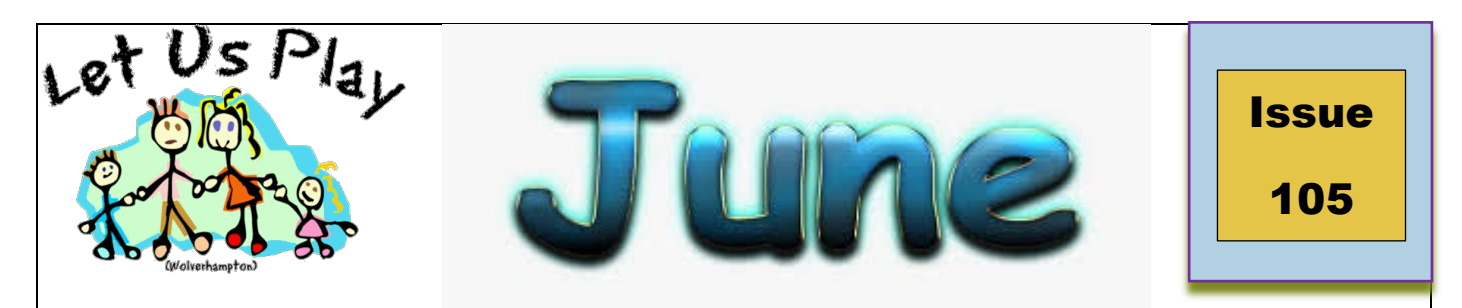
For children with special needs and disabilities and their siblings